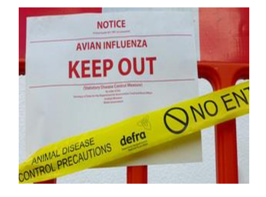
Annually – Avian Influenza