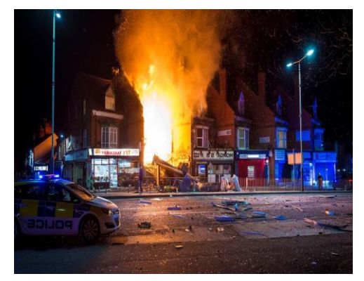
2018 – Hinckley Rd, Leicester Arson