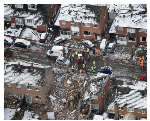
2017 – Birstall Gas Explosion