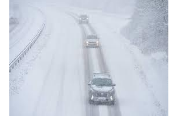
2021 Extreme Weather